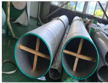
2 nd Step