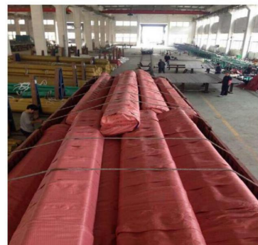
3 rd Step (with Nylon Strip)