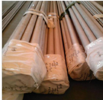
2 nd Step