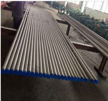
1 st Step